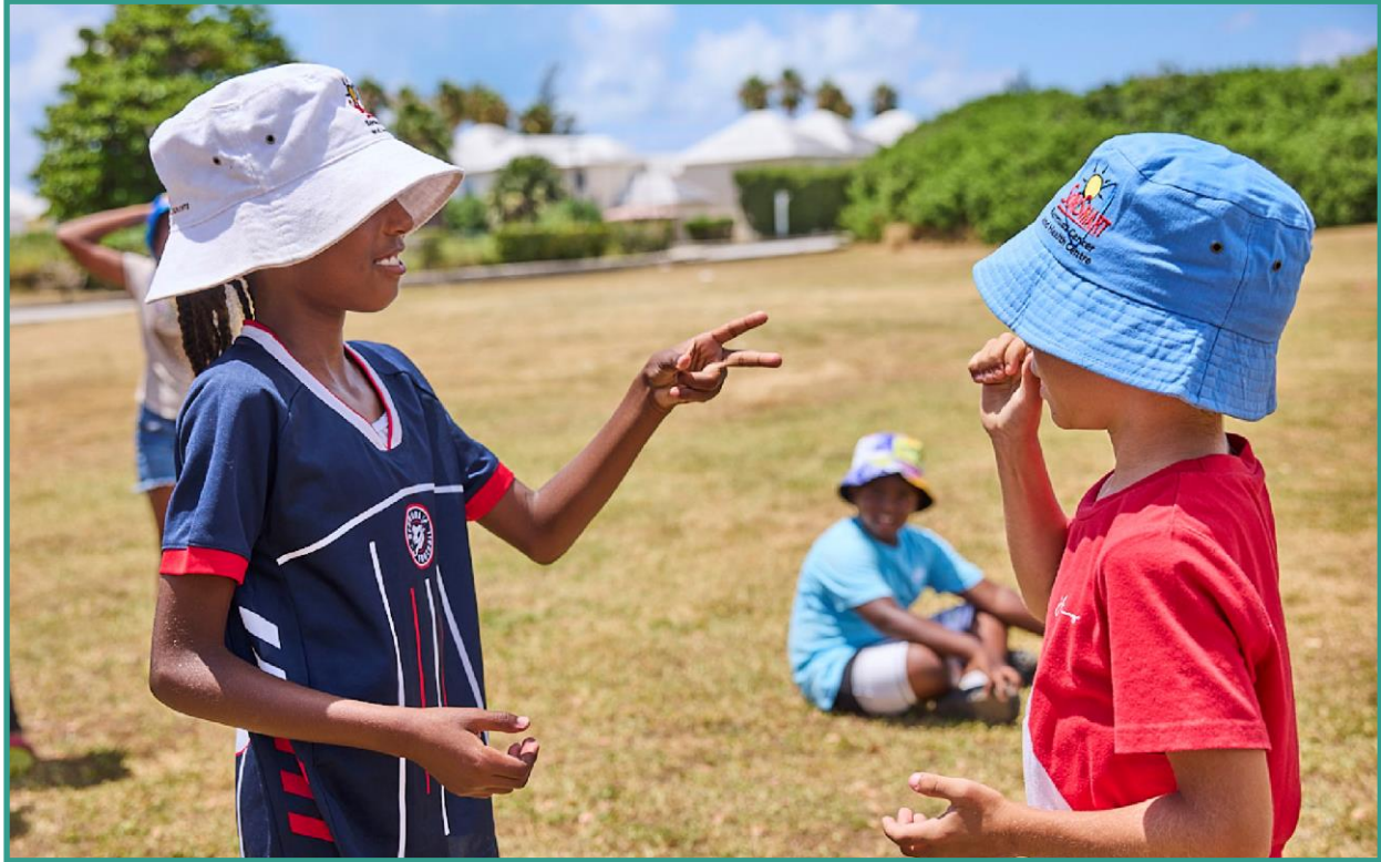
National Violence Reduction Strategy