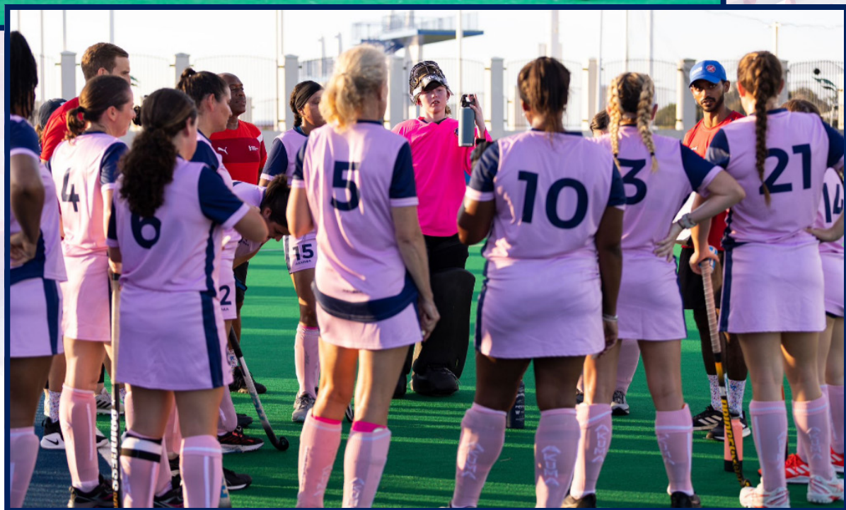
Women's National Hockey Team