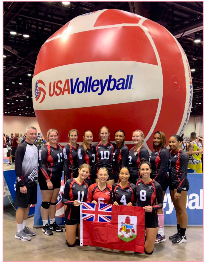
Bermuda Women's Volleyball Team at the 2022 USA Volleyball Open National Championships

There are still three more tournaments taking place this summer: Same Sex on July 2nd, Coed on July 23rd and Same Sex on August 13th. Anyone interested in participating should follow the BVA's Instagram page (@bdavolleyball) to stay up to date on information.