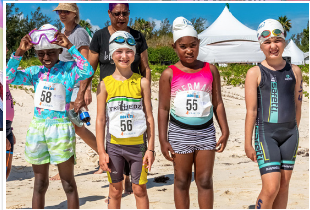
32nd Annual Clarien IronKids Triathlon