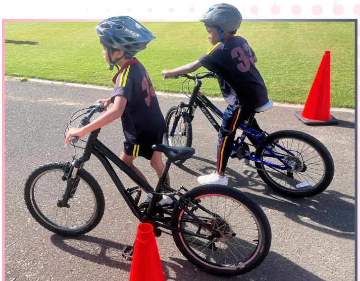
BTA Primary School Program – Prospect Primary School Students