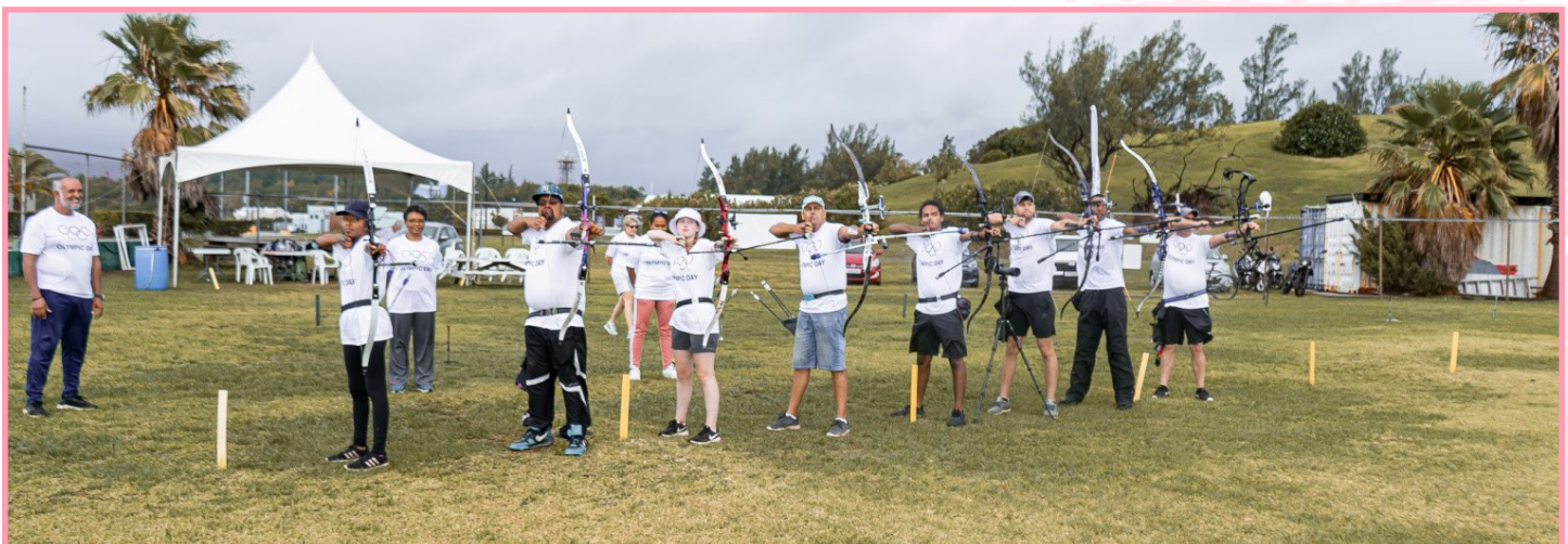
Olympic Day Celebrate Event