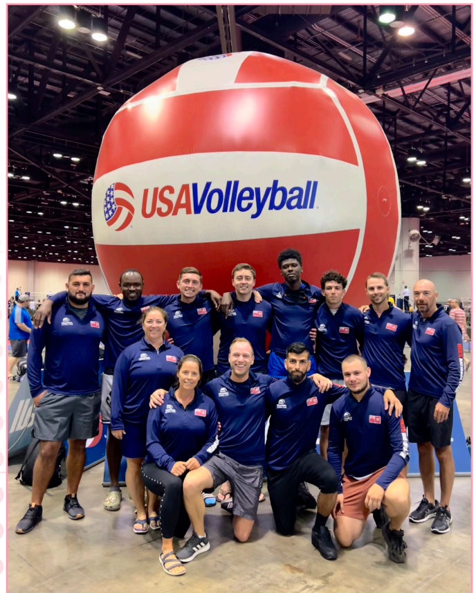
Bermuda Men's Volleyball Team at the 2022 USA Volleyball Open National Championships