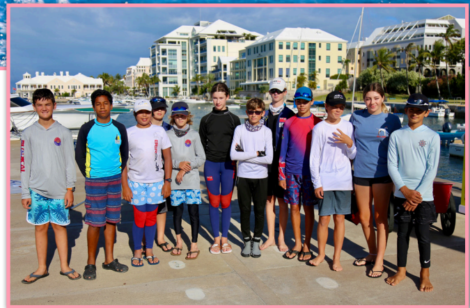
Race to the Rock Participants