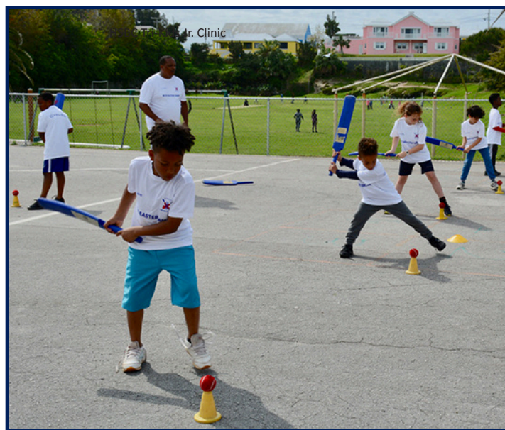
Kids practicing batting drills at cricket camp.

There will also be changes in infrastructure, as each member club will be presented with an infrastructure report on their grounds after completed assessments. Grounds will then be selected for upgrades within the next five years with signed partnership agreements.