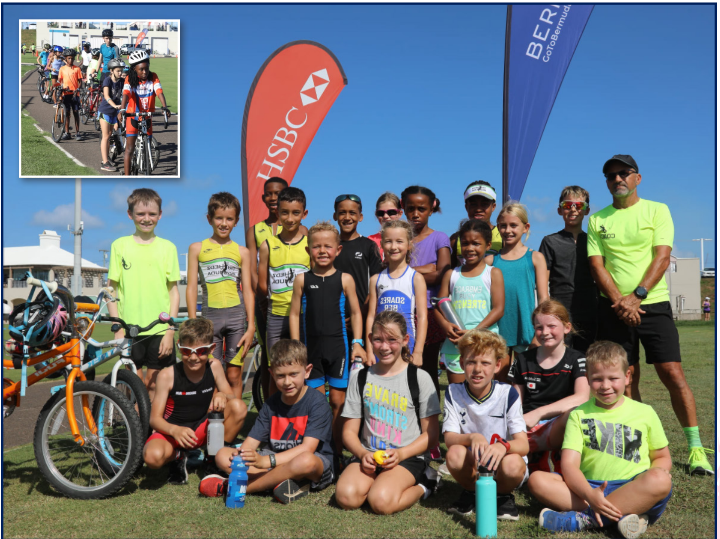
HSBC Tri-Kids Jr. Clinic