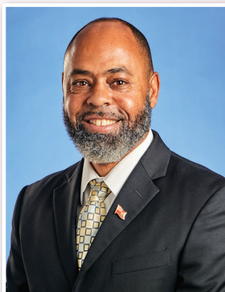
Minister of Youth, Culture and Sports