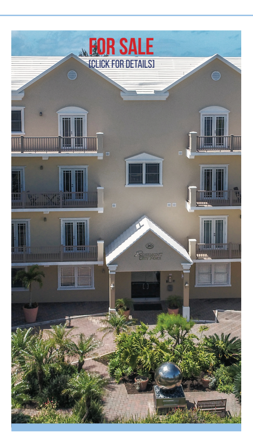
Rosemont City Place, magnificent views of the City of Hamilton.