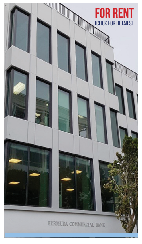
Penthouse floor with large balconies and views of Hamilton Harbour.