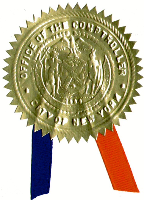
SCOTT M. STRINGER COMPTROLLER SEPTEMBER 23, 2017

For more than three decades of outstanding work to support families and young New Yorkers across the five boroughs; for his commitment to ending gun violence in African American communities; for his steadfast leadership as Chairman of the Black Men Against Gun Violence Task Force and President/CEO of the Center for Black Student Achievement; for his dedicated efforts to address issues affecting our City's African American residents; for working together with community leaders and elected officials to raise awareness about the negative impacts of gun violence; for his devoted efforts to improve the quality of life for all New Yorkers; and for his tremendous contributions to the City of New York.