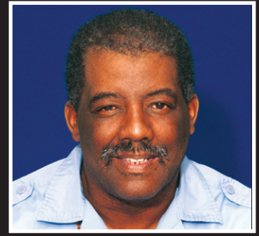
BY ALVIN WILLIAMS

St. Catherine Beach and moved our way up to Somerset.