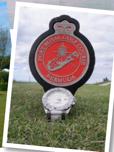
The beautiful ETIQUIS timepiece was the star prize; always time for tea; ducks didn't want to miss out