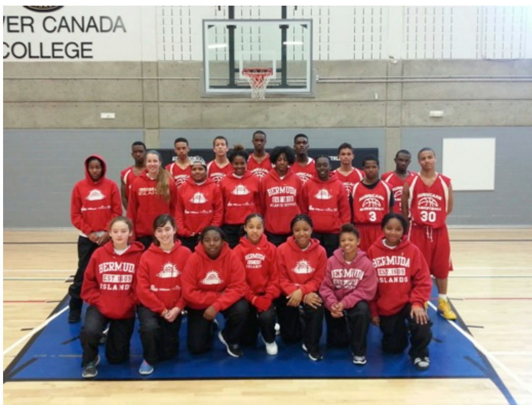
The young ladies of Coach Bullet Basketball coming out and supporting us at our game against Stanstead Select held at Lower Canada College. Thanks Ladies!