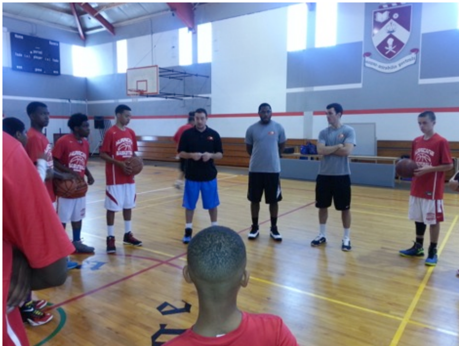
Alexander Basketball Academy Coaches & Team Hurricane Players

"The first time we run a camp in a new country it is always difficult to plan for the first day. Without a good understanding of the level of basketball we will soon encounter we can't be sure of what drills to run. Running a drill I use with my players at Washington College may not be beneficial for a kid who is first learning the game. The remarkable thing about this camp is that the coaches of Team Hurricane have already provided young Bermudians with the basic skills that will help them to succeed as basketball players at a high level. Team Hurricane's mastery of the basic concepts of basketball empowered our Alexander Basketball Academy staff to run the advanced drills we would use with players in our advanced Global Squad program. The challenge for these young players now is to find time to hone their impressive skills on a beautiful island with more golf courses than gymnasiums, a stark difference from their American counterparts who never lack opportunities for gym space."