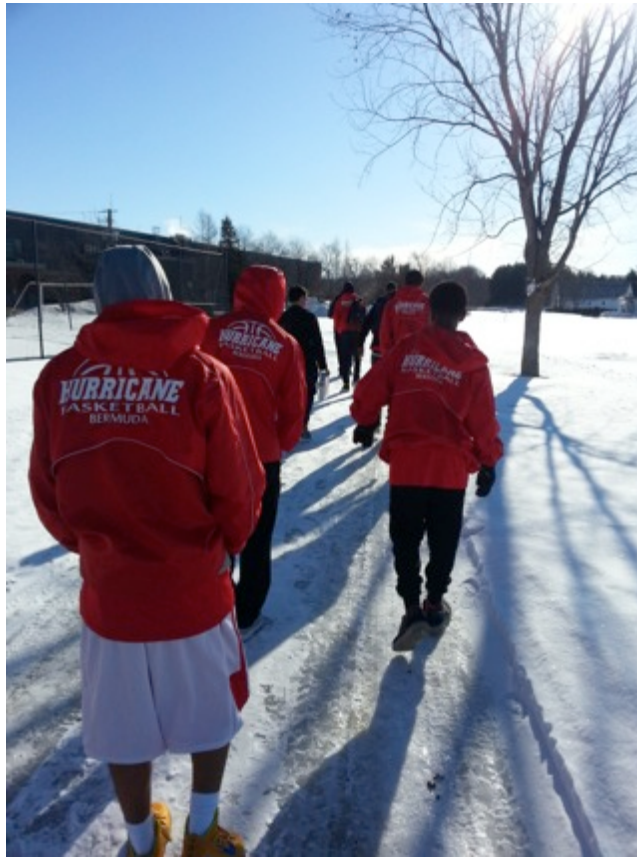
Team Hurricane experiencing snow in April!