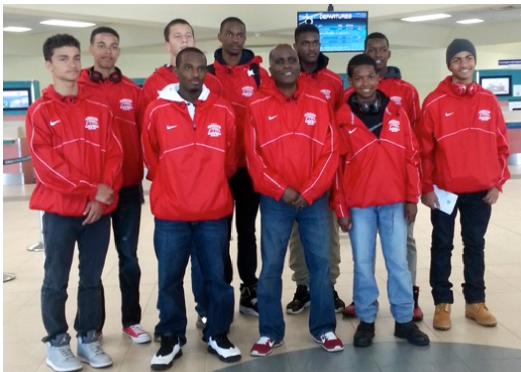
Team Hurricane Canada Bound