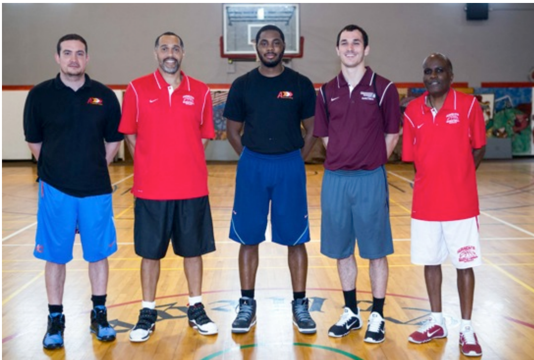
Alexander Basketball Academy & Team Hurricane Coaches