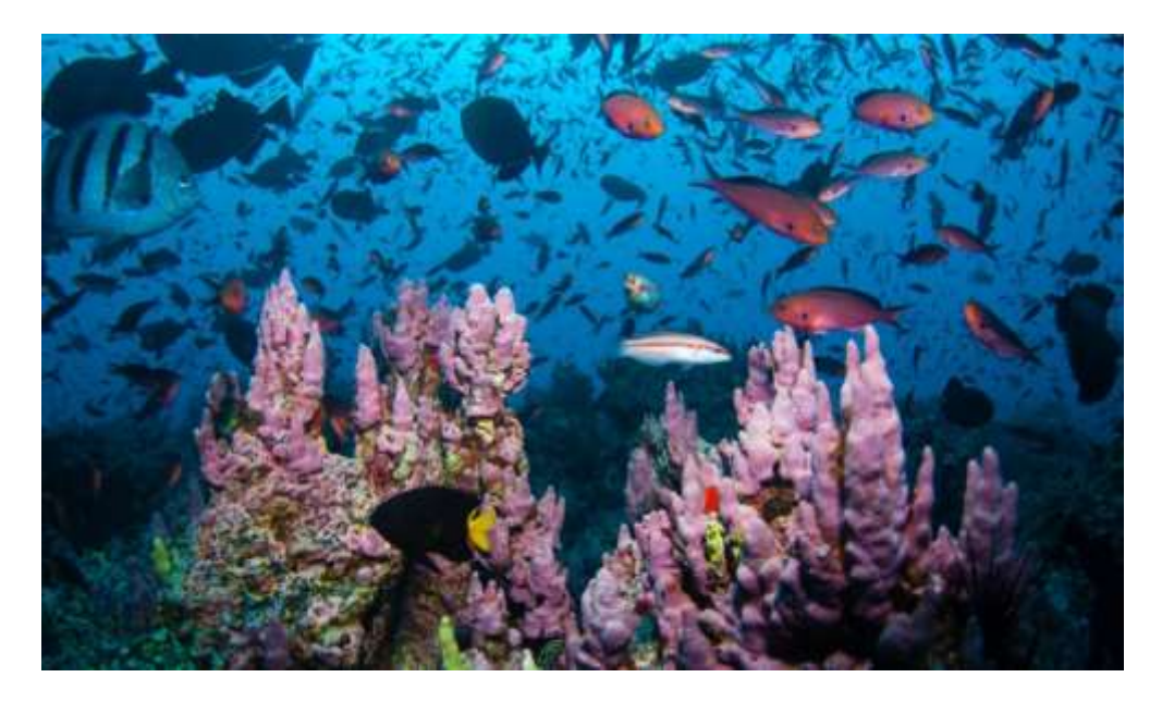
Figure 9: Coral biodiversity in Ascension (EIDCF012)

Dependencies Steering Group', inviting them to submit requests for contributions to biodiversity research projects.