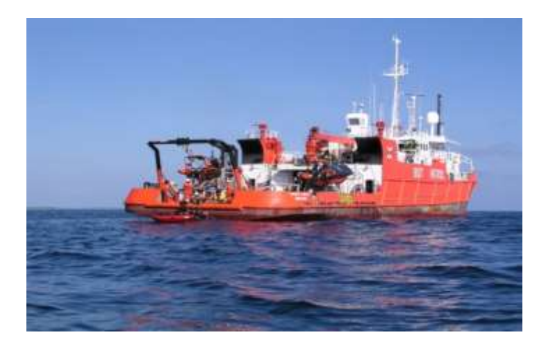
Figure 8: BIOT Patrol Ship (<u>19-027</u>)