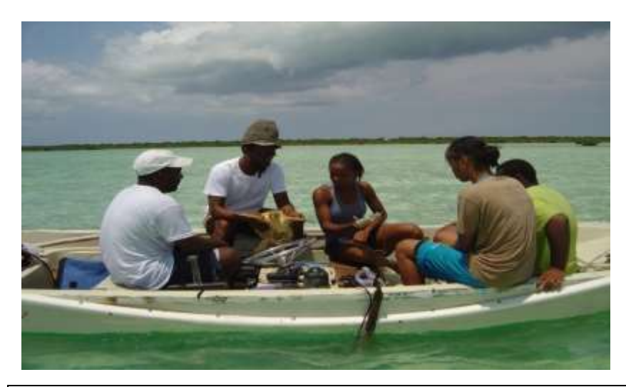
Figure 13: Turtle work in the British Virgin Islands (<u>12-</u> <u>023</u>)

Case Study 16: Implementing the Hamilton Declaration on Collaboration for the Conservation of the Sargasso Sea.