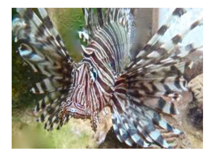
Figure 2: Lionfish in Bermuda (<u>DPLUS001</u>)

The invasion of lionfish ( Pterois miles and Pterois volitans ) in the Caribbean ocean has recently been recognised as one of the world's top marine conservation issues and may well prove to be one of the greatest threats of this century to warm temperate and tropical Atlantic reefs and associated habitats. JNCC has taken the lead by organising two FCO-funded workshops in the Caribbean Region, enabling UKOTs to develop a long term response strategy for sustainable control of lionfish.