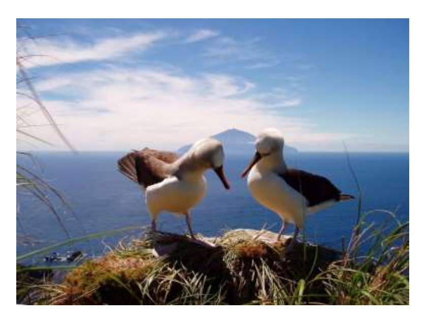
Figure 6: Albatross on Nightingale Island with Tristan in the background (<u>12-010</u>)

The first two rounds of Darwin Plus have seen approximately £4m supporting twenty-nine projects across the Territories, including projects ranging from habitat restoration in the South Atlantic Territories to mapping marine habitats in the Caribbean.