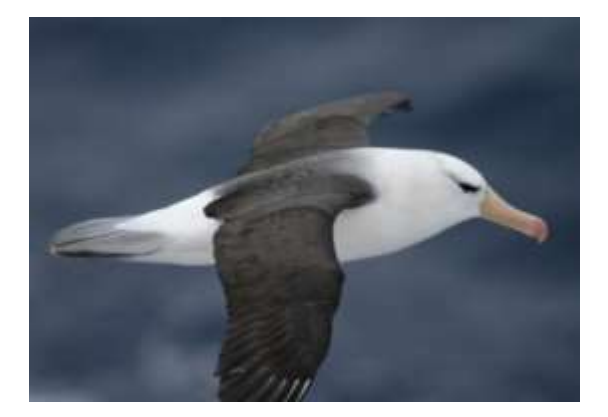
Figure14: Blackbrow Albatross, Falkland Islands (<u>18-019</u>)

Building on this success, the UK's delegation to the 11<sup>th</sup> Conference of the Parties to the Convention on Biological Diversity (CBD CoP11) in Hyderabad, India, in October 2012, included a marine expert from Bermuda, who provided support and input in relation to the CBD's programme of work on Marine and Coastal Biodiversity.