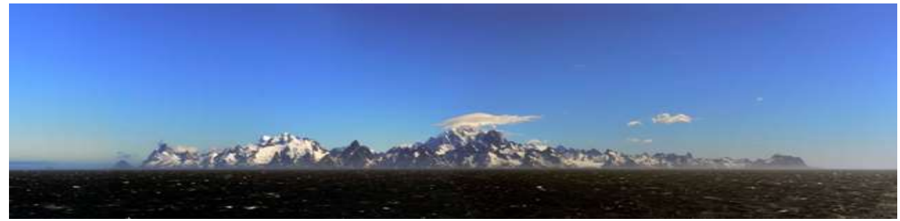
Figure 1: Seeing the big picture.... South Georgia (<u>18-019</u>)