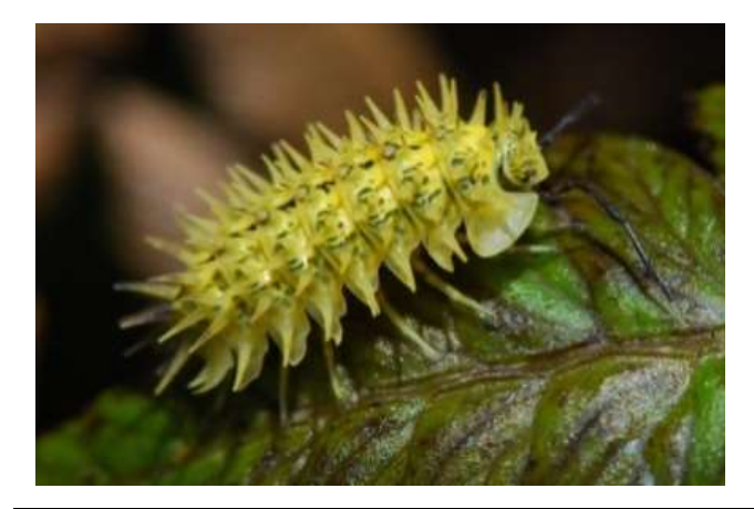
Figure 7: Spiky Yellow Woodlouse of St Helena (<u>EIDCF004 and Flagship</u> <u>Species Fund project</u>)

Case Study 9: Flagship Species Fund funded project on St Helena's Spiky Yellow Woodlouse The population of this unique St Helena invertebrate species has declined catastrophically over the last ten years due to habitat deterioration and the effects of predators (rats and mice) and competitors (non-native woodlice). Recent observations suggest that the population may be as low as 50 individuals. This project aimed to gather sufficient evidence to develop a Species Recovery Plan for the Spiky Yellow Woodlouse and enhance skills for invertebrate monitoring among local staff as well as raising the local and international profile of St Helena's threatened endemic invertebrates and their cloud forest habitat.