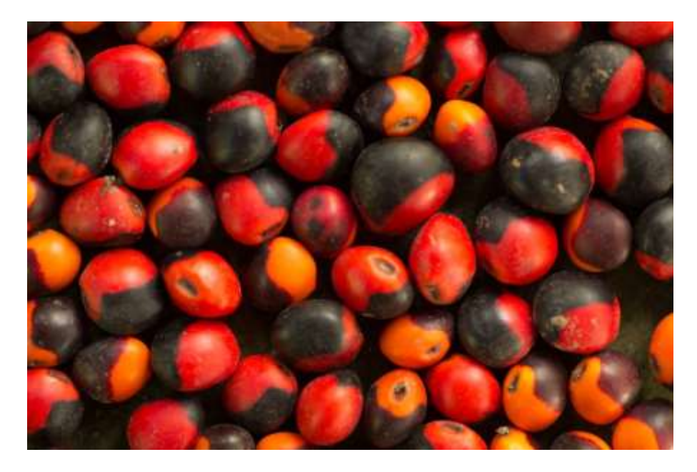
Figure 4: Seed collection in the Caribbean (DPLUS006)

Environmental Mainstreaming is an innovative approach by the UK Government to help the Territories put environmental considerations at the heart of decision making. Projects have been completed in the Falklands, British Virgin Islands (funded by the FCO) and Anguilla (funded by Defra). We are in the process of extending the initiative to Bermuda and the Turks and Caicos Islands.