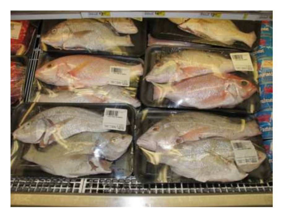
Figure 11: Turks and Caicos Fish (EIDCF010)

it seeks to improve the sustainability of its fisheries through an improved licensing and monitoring regime.