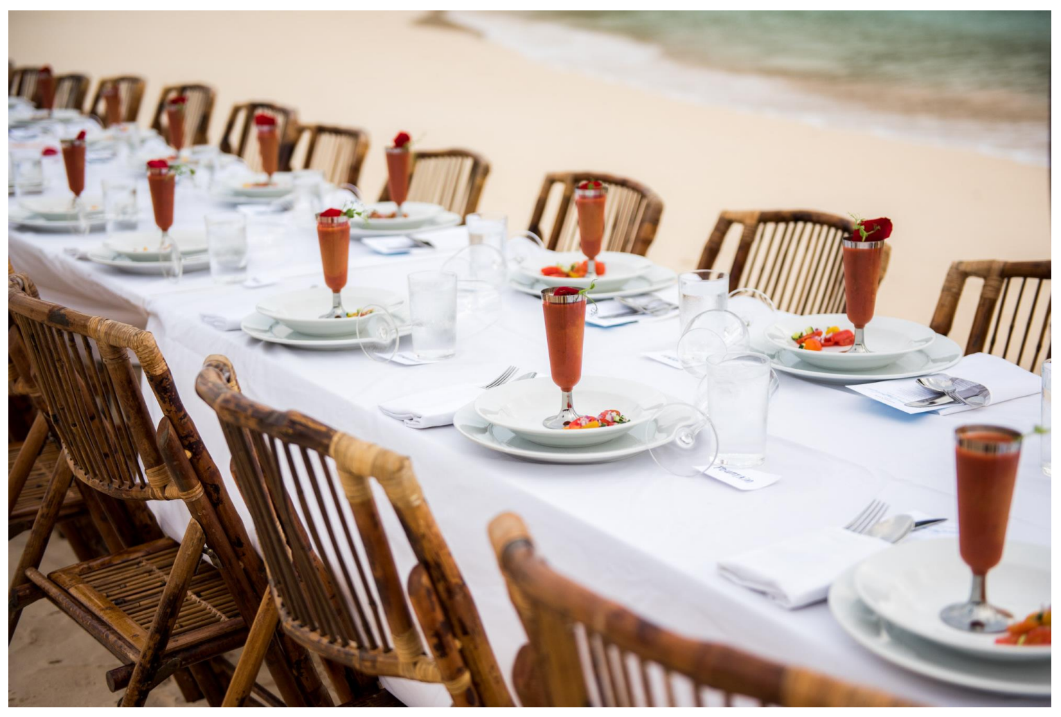
Outstanding in the Field