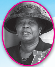
DAME LOIS BROWNE- EVANS, DBE, JP, LLB 1927–2007