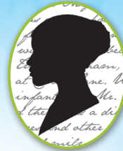
MARY PRINCE c. 1788–