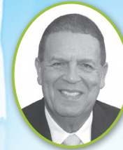
THE HON. SIR JOHN W. SWAN, KBE, JP 1935